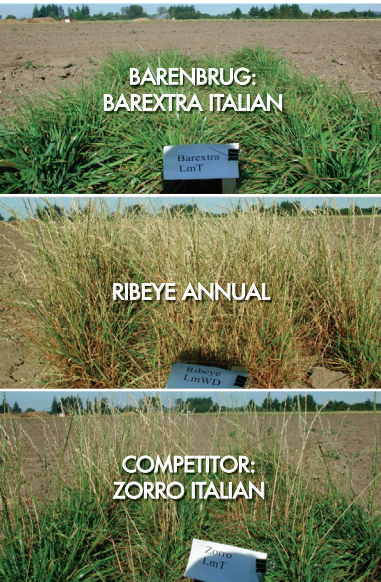
Spring planted "grow-outs." Ribeye is annual so seed heads should be expected. Both BarExtra and Zorro are Italian ryegrasses. However, Zorro, a competitor's variety, has annual contamination.

Barenbrug has the strictest guidelines for the genetic purity of Italian ryegrass. Many steps are taken to insure that our Green Spirit Italian ryegrass is not contaminated with annual ryegrass. Barenbrug pays a premium to find growers who have clean fields, free of annual ryegrass contamination. Additionally, our research department conducts multiple "grow-outs" to determine the genetic purity of various fields. A grow-out is a planting of seeds to test certain characteristics. Though this process is laborious and expensive, it insures that when you see the Barenbrug yellow bag you can trust that you are buying the best quality seed on the market.