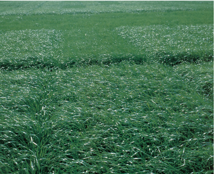
Barenbrug has the strictest guidelines for genetic purity of Italian ryegrass.

Establishment: Green Spirit may be planted in the fall or spring. We recommend drilling Green Spirit for best results. Prior to planting, apply 100lbs of a 20:20:20 fertilizer. For fall planting, plant immediately after harvest to improve establishment and graze or cut prior to winter in order to thicken the stand and promote winter survival. For spring planting, plant early in the spring. Green Spirit may be planted via full-cultivation, no-till drill or broadcast seeding. When planting as a nurse crop for a perennial or interplanting into an existing alfalfa stand,