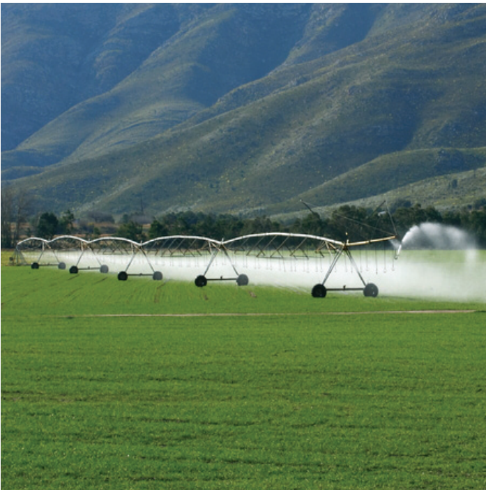
Green Spirit produces impressive forage yields of exceptional high quality feed.

The varieties used in Green Spirit require prolonged periods of cold weather for vernalization. Once vernalized the plant has the ability to produce seed heads which result in the loss of forage quality. Inferior products that imitate Green Spirit vernalize with much shorter periods of cold, producing seed heads soon after planting when spring night time temperatures drop.