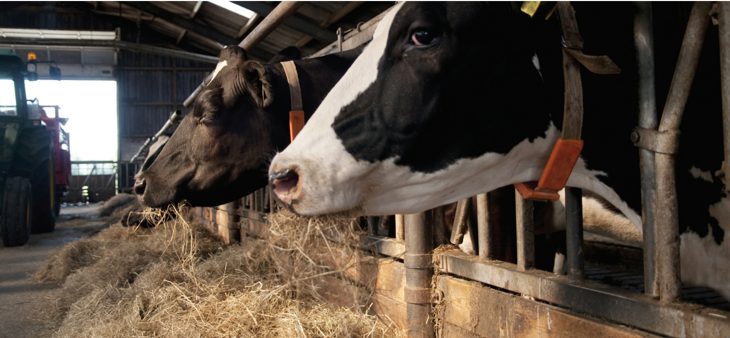
The forage value of Green Spirit is higher than that of corn while maintaining similar DM yields. Green Spirit creates great economic advantages for producers.