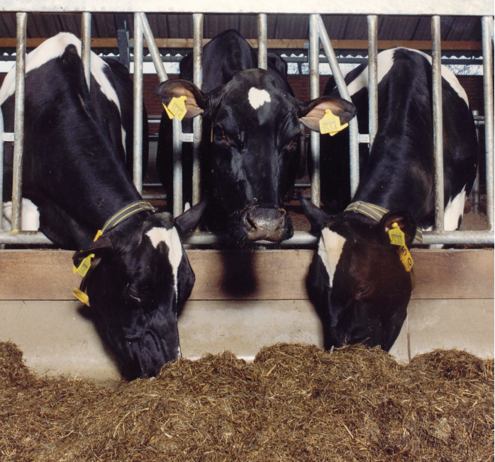
Green Spirit is ideal as silage or green chop for high producing dairy cows.

The yield results are displayed in Table 1 and 2. Green Spirit not only significantly out yields both alfalfa and soybeans, but it even comes close to yielding the same as corn silage. But what does it do to the rotation? In the study, every crop was rotated out and followed by corn silage. As you would expect, the worst corn silage yields were on ground that was planted to corn silage the previous year. But here is the surprising result: The highest yields of corn silage were on ground that was planted to Green Spirit the previous year. There was no yield